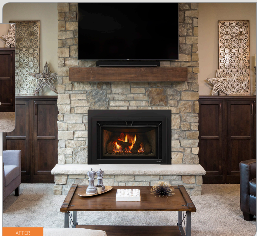
Shown: Supreme gas fireplace insert by Heat & Glo