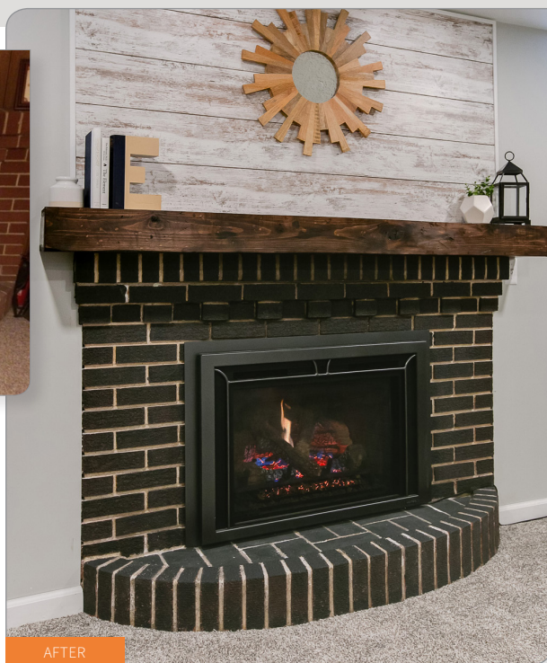
Shown: Supreme gas fireplace insert by Heat & Glo