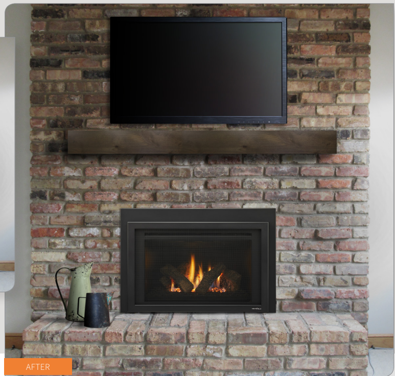
Shown: Provident gas fireplace insert by Heat & Glo